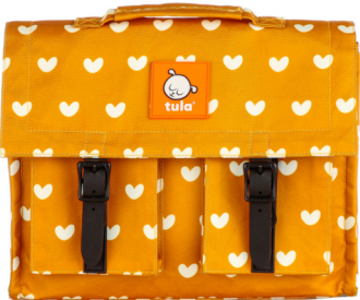
TULA BACKPACK – PLAY