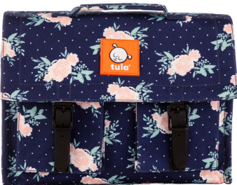
TULA BACKPACK - BLOSSOM