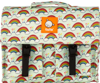
TULA BACKPACK – RAINBOW SHOWERS