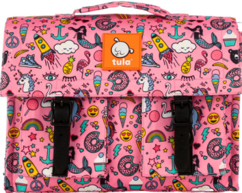
TULA BACKPACK - STICKERS