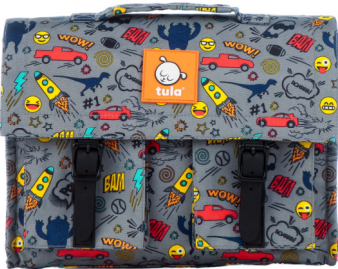
TULA BACKPACK - STAMPS